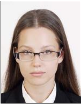
The frames across eyes