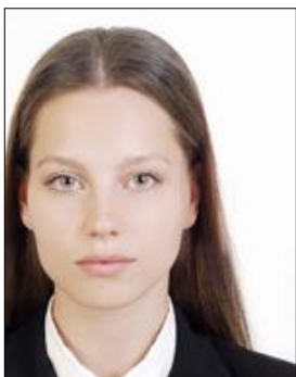
Image is not centered

■ Not meeting the requirement sizes and the standards