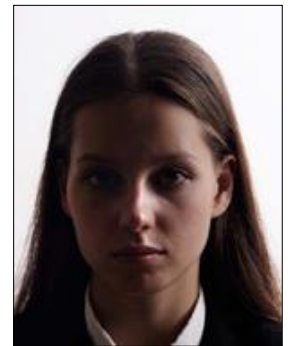
The part of the face is in shade