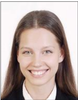
Mouth opens Looks different from normal face expression