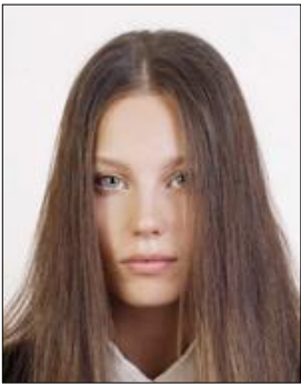
Hair covering eyes