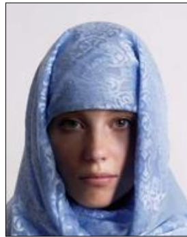
The part of the face is in shade because of head covering. (if there's no shadows and show the full face, head covering is allowed)