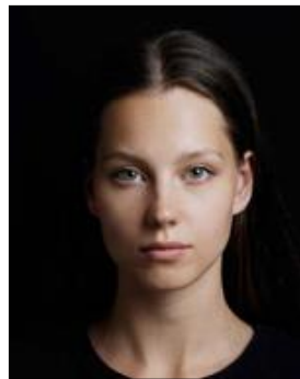
Vaguely-outlined image because of too dark behind