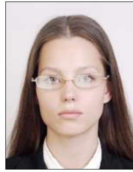
Reflection on lens